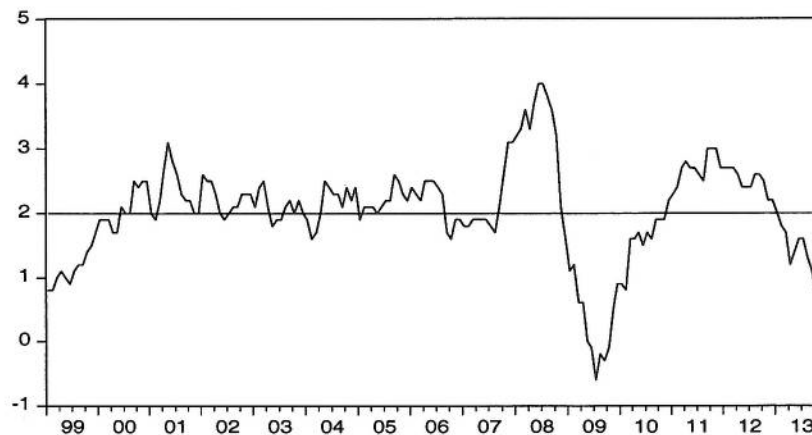
Figure 1. European inflation rate January 1999–November 2013 vs. 2% inflation target in %; Source: EUROSTAT.

In this context one can refer to the well-known policy rule by Taylor [5]: