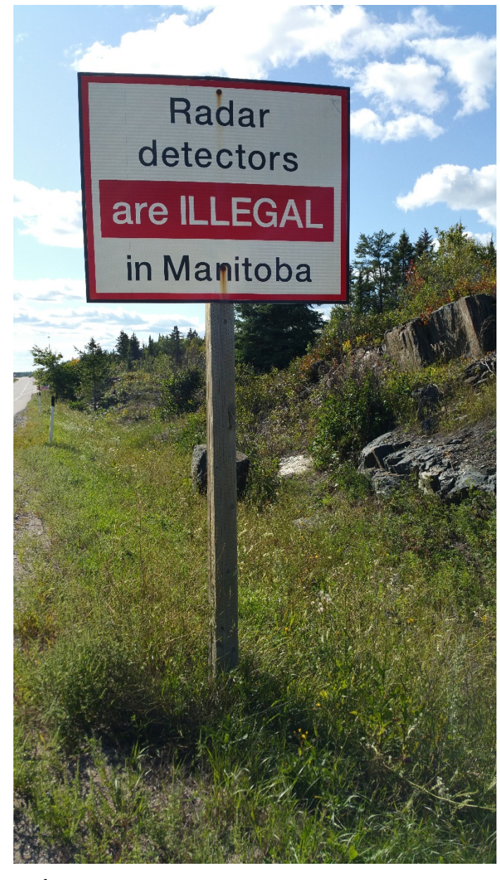
Hwy 1, Manitoba