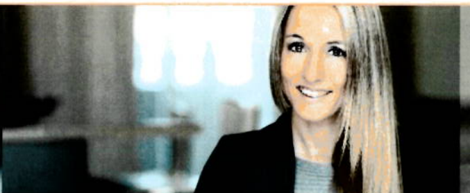
YOUNG BROKERS COMMITTEE