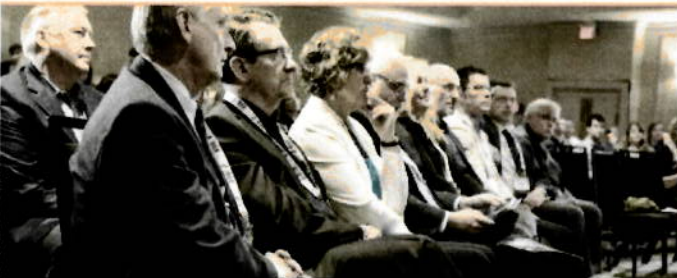
IBAM BOARD MEMBERS