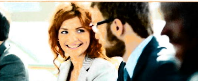
IBAM STAFF MEMBERS