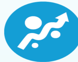
Future Business Agility