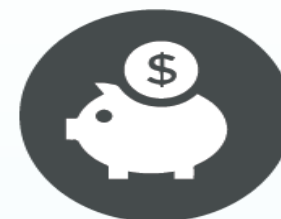
Cost Savings & Efficiency